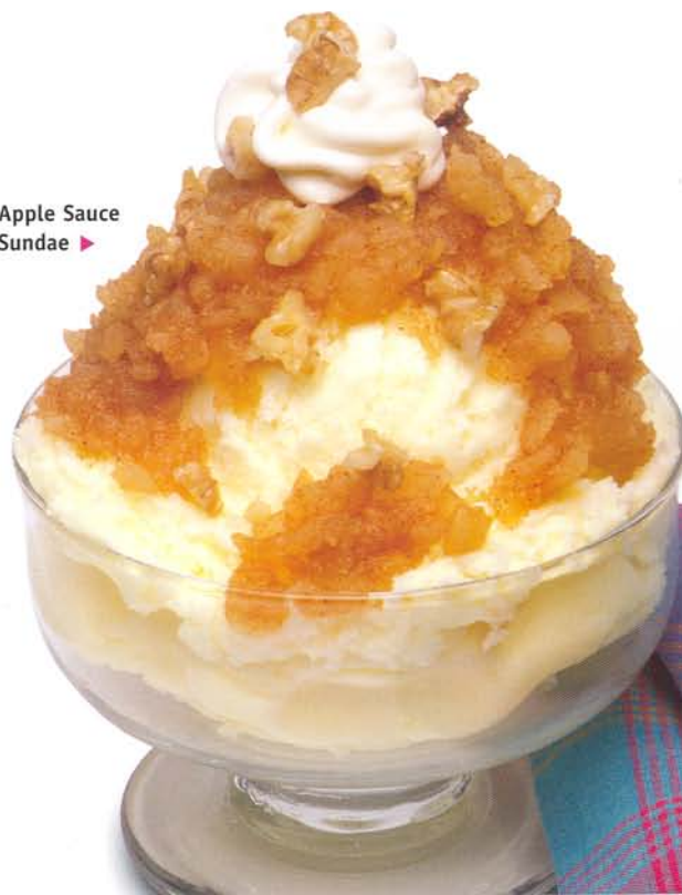
Apple Sauce Sundae ▶