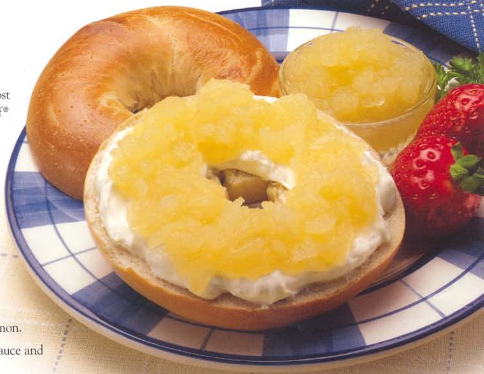
▲ Toasted Bagel with Premium Apple Sauce or Apple Butter