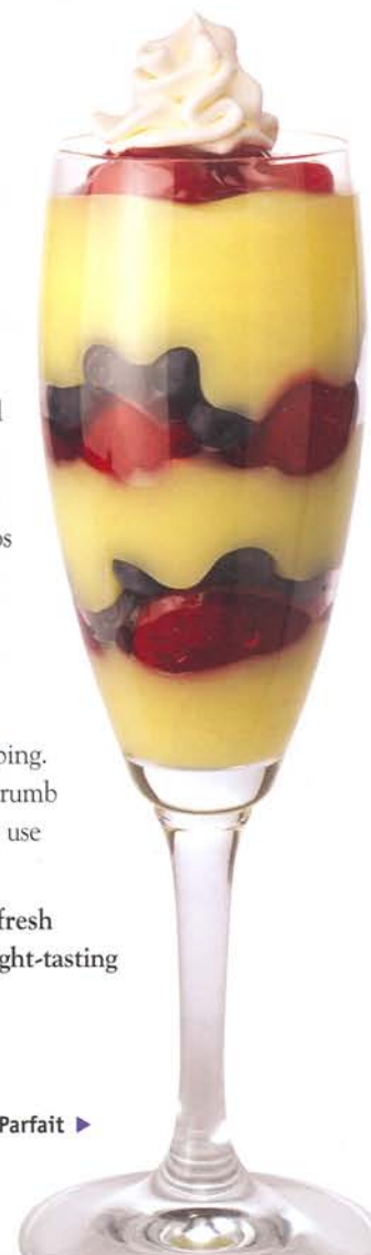
▶ Lemon-Strawberry Parfait