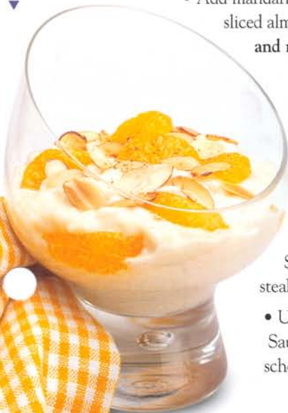
▼ Mandarin Orange Rice Pudding