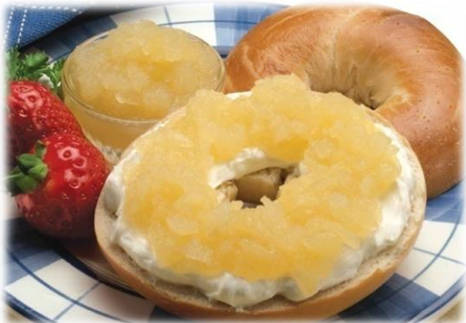
Toasted Bagel with Premium Apple Sauce

Lucky Leaf UPC – 28500 31050 Musselman's UPC - 3732 31050