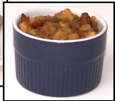
Apple Bread Pudding