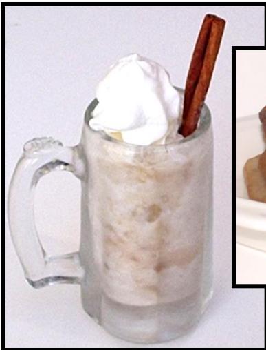
Easy Apple Milkshake

★ Its uses as an ingredient are only ★ limited by your imagination